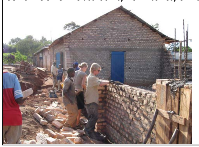
EDUCATION: High School and College