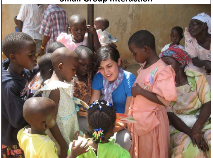
EDUCATION: Schools and Orphanages